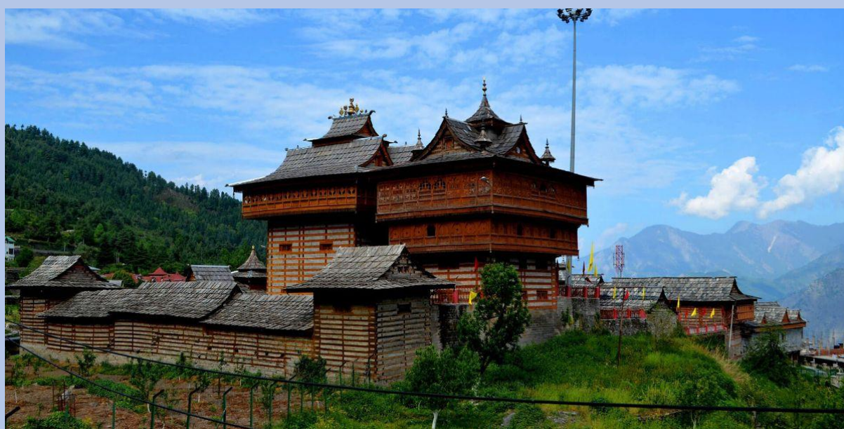
BHIMAKALI TEMPLE, SARAHAN, RAMPUR

Another legend surrounding the goddess relates to the Daksha Yajna incident, when the ear of Sati, daughter of King Daksha, is said to have fallen on the ground here, making this a place of worship as a peetha-sthan . This is how Bhimakali temple became one of the 51 shakti peethas in the country.