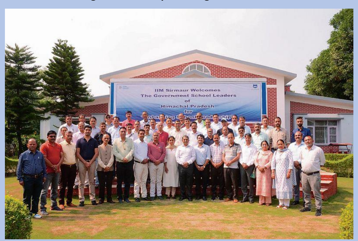
IIM – Sirmour begins leadership training for state school heads.